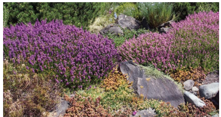
Drought tolerant landscaping adds beauty while helping preserve our valuable water resources.