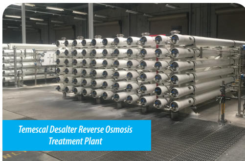
Temescal Desalter Reverse Osmosis Treatment Plant

This Consumer Confidence Report (CCR) reflects changes in drinking water regulatory requirements during 2016. All water systems are required to comply with the state Total Coliform Rule. Beginning April 1, 2016, all water systems are also required to comply with the federal Revised Total Coliform Rule. The new federal rule maintains the purpose to protect public health by ensuring the integrity of the drinking water distribution system and monitoring for the presence of microbials (i.e., total coliform and E. coli bacteria). The USEPA anticipates greater public health protection as the new rule requires water systems that are vulnerable to microbial contamination to identify and fix problems. Water systems that exceed a specified frequency of total coliform occurrences are required to conduct